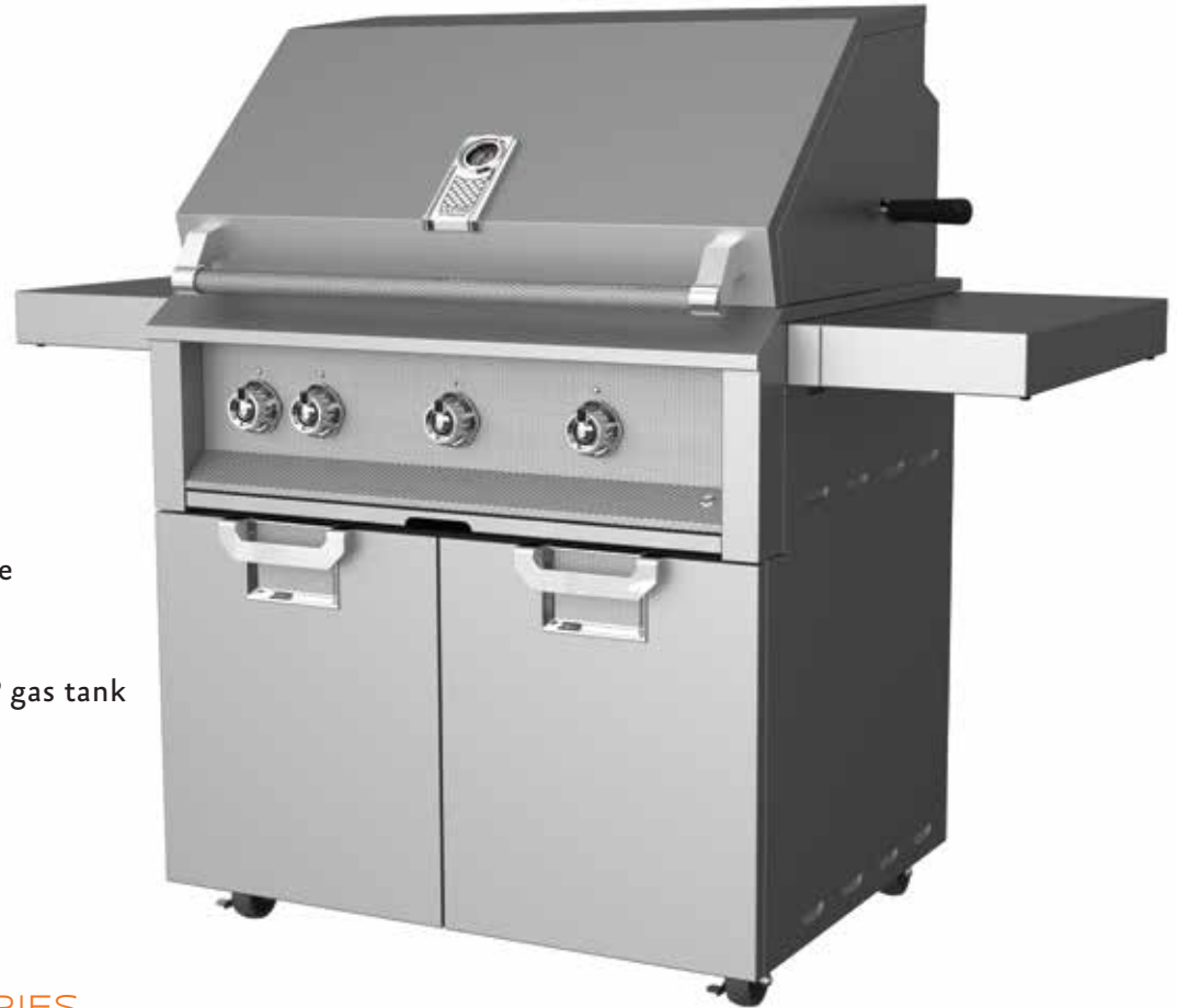
Grill Head Sold Separately Showing cart model ECD36