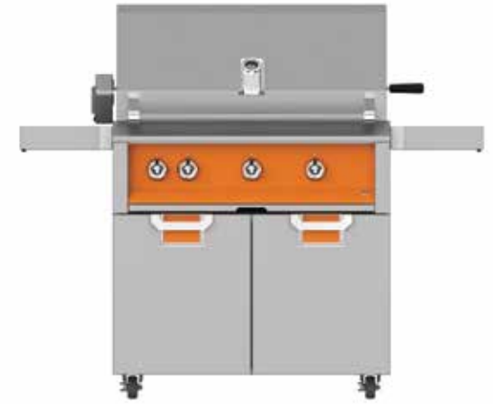
Shown in Optional Color Grill sold separately