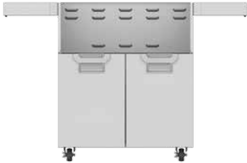
30" TOWER CART